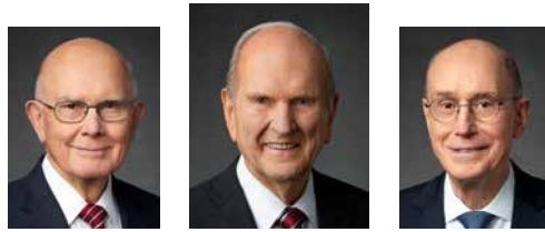
Dallin H. Oaks First Counselor Russell M. Nelson President Henry B. Eyring Second Counselor