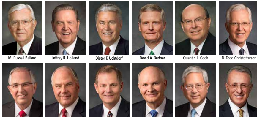
M. Russell Ballard Jeffrey R. Holland Dieter F. Uchtdorf David A. Bednar Quentin L. Cook D. Todd Christofferson Neil L. Andersen Ronald A. Rasband Gary E. Stevenson Dale G. Renlund Gerrit W. Gong Ulisses Soares